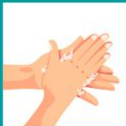
Rub hand palm to palm