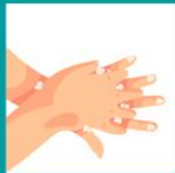
Rub palm over the back of the other hand