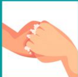
Back of fingers to opposing palms with fingers interlocked