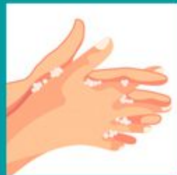
Scrub between your fingers