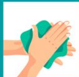
Dry Your hands